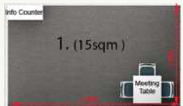
Choose your booth (min 6 sq.m at German Pavilion)