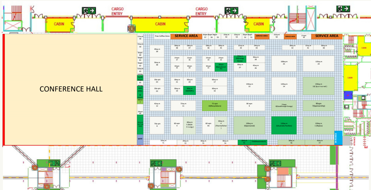
Prime location: Hall 1B