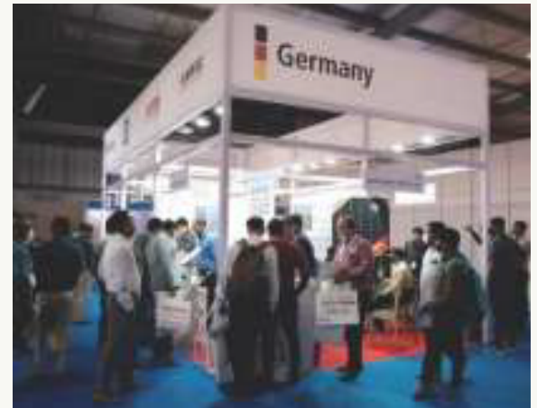
Fully furnished booth

Benefit from common infrastructure, meeting rooms, a lounge and further synergies