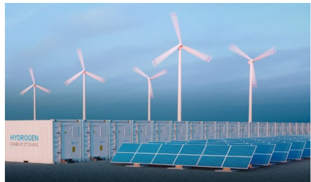
The Business Alliance on Green Hydrogen supports projects along the entire value chain for green hydrogen and its derivatives.

However, the cost of producing green hydrogen is currently too high and the production capacities are too limited. Moreover, there is still no reliable framework in place for the profitable sale of green hydrogen.